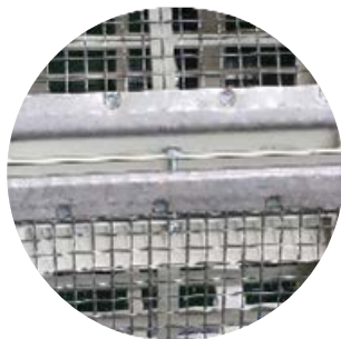
Additional external wire screens optional 2 to 80 mm