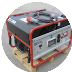
Petrol power generator