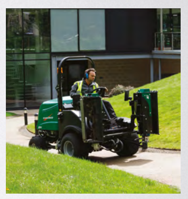
Powerful, clean, green Stage V 49.6HP engine