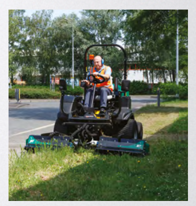
Ultra-comfort, smart operator platform