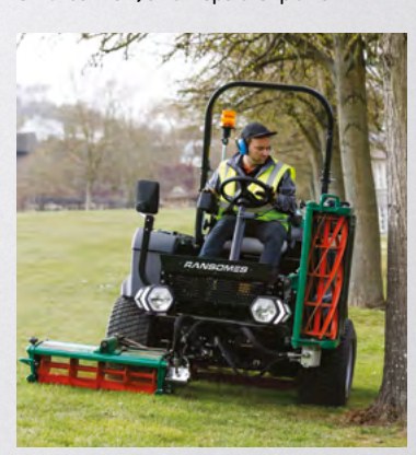
Easily adaptable to MAGNA cylinders

Specifications, while correct at time of publishing, may change without notice. Requires Ultra Low Sulphur Diesel. Cutting Capacity 10% allowance for overlap.